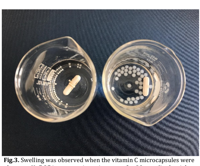
Fig.3. Swelling was observed when the vitamin C microcapsules were kept at pH: 7.35 in an aquatic environment for 8 hours (in the right beaker).

The study showed that the microcapsules used for vitamin C encapsulation are suitable for absorption in the small intestine. The release rate of vitamin C increased towards pH values close to 7.0, with a higher rate of 83.97% observed at pH 7.0. This is significant as vitamin C absorption takes place in the small intestine (Said, 2011). Additionally, temperature affected the release of vitamin C from the microcapsules, with approximately 47.2% release at body temperature (37°C) and a higher fluctuation in vitamin C release was observed at 20°C.